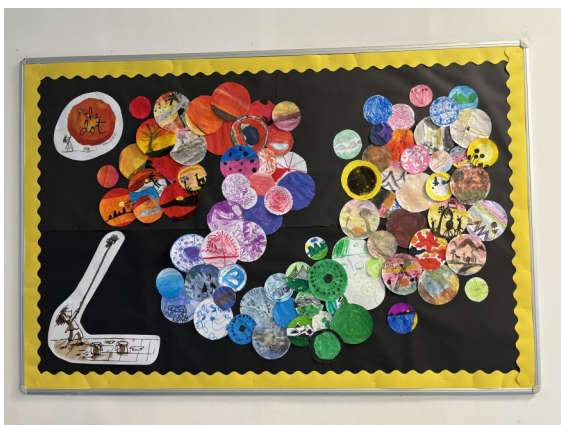
Check out our whole school project of 'The Dot'! Can you spot your dot?

Black History Month - 1st - 31st October