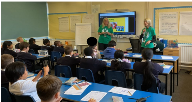
The NSPCC came to deliver their 'Speak Out. Stay Safe.' programme!